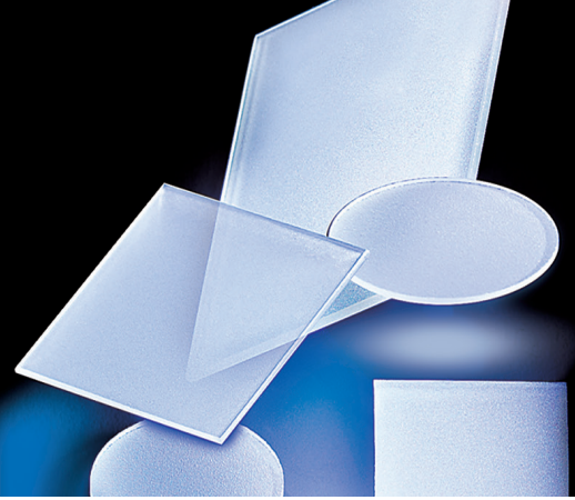
Ground Glass Diffusers Typical Transmission