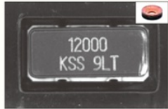
The new HPR2-75RD allows for text imaging that limits surface reflection.

Applications: Examining the exterior by color for multi-colored workpieces, examining the exterior of food products, etc.