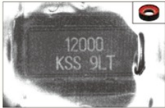
With Ring Lights, reflection from the embossed tape surface makes it difficult to perform stable examination.