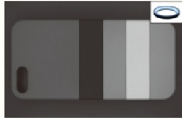
Imaging with blue illumination