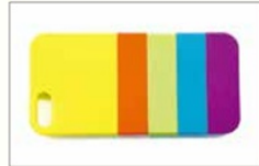
Workpiece: Smartphone case