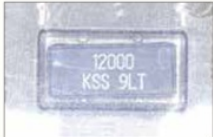
Workpiece: Electronics part in embossed tape