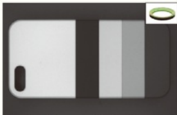
Imaging with green illumination