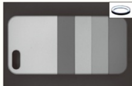
Imaging with white (all colors lit up) illumination