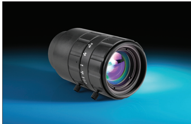
Figure 3. Edmund Optics' commercially available 25mm SWIR imaging lens.