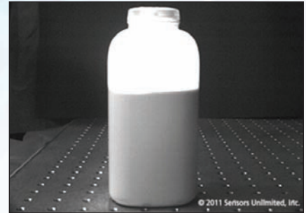
Figure 2. Example of a visibly opaque bottle in the visible band (left) and the SWIR band (right) which facilitates observation of the material level inside the bottle.

be used to collimate the infrared laser and collect the reflected beam back onto the photo-sensor. The back-end time-of-flight algorithm is then used to yield the range value. All that is asked of the lens is to collimate a light source and refocus the reflected light onto the detector. Off the shelf infinite conjugate aspheres and, in some cases, achromats or singlets may suit the need depending on signal to noise requirements. In this case, a COTS lens can be used in the assembly and the surrounding mechanics designed to meet the optical specifications — primarily focal length — of the COTS lens. While the surrounding mechanics may be ITAR-controlled since they are custom designed for the ITAR controlled assembly, the lens is not and can therefore be shopped around for the best price-to-performance ratio.