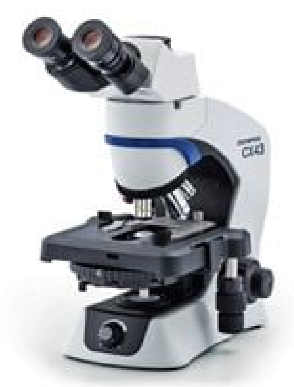
Image shown is full assembly. Each component sold separately. See Technical Information tab for additional details.